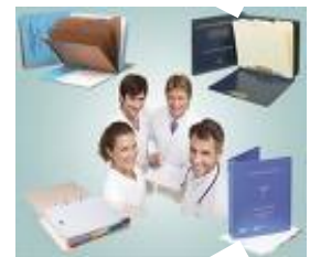
Health Information Management