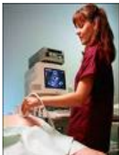
Diagnostic Medical Sonography