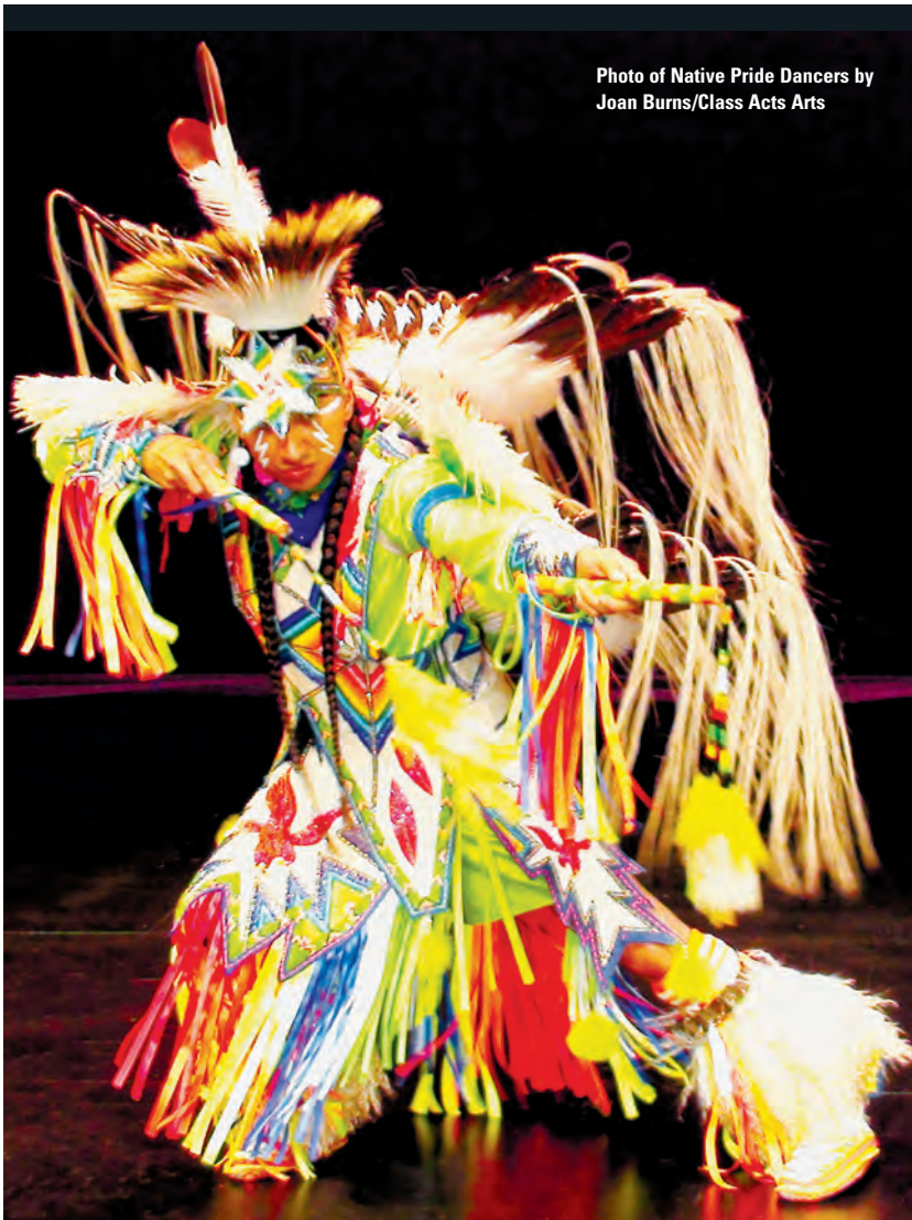
Photo of Native Pride Dancers